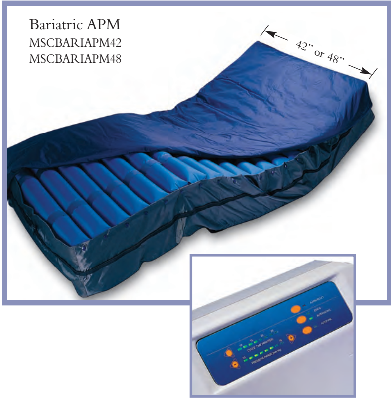
Bariatric APM MSCBARIAPM42 MSCBARIAPM48