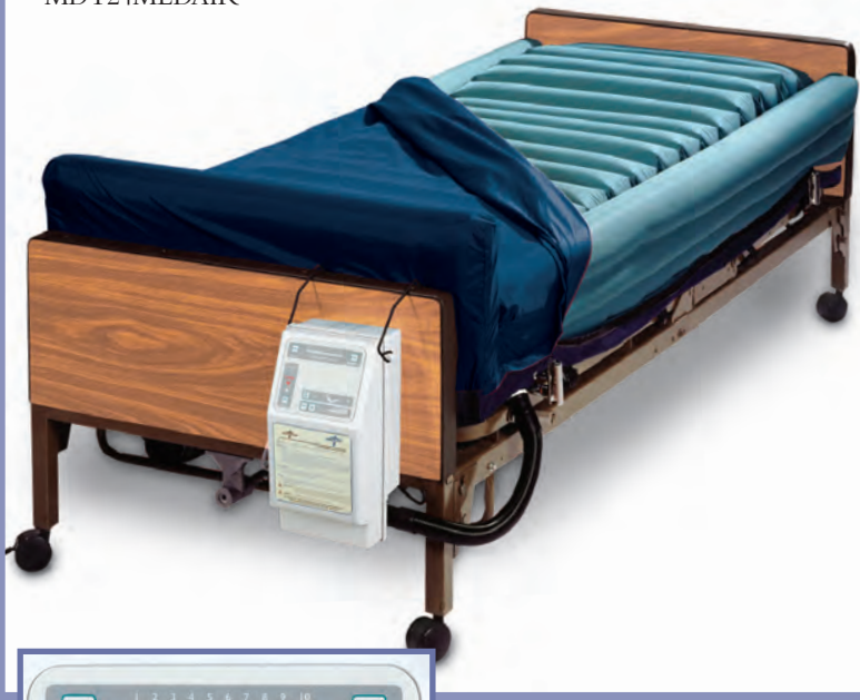
Medline MedTech Air MDT24MEDAIR