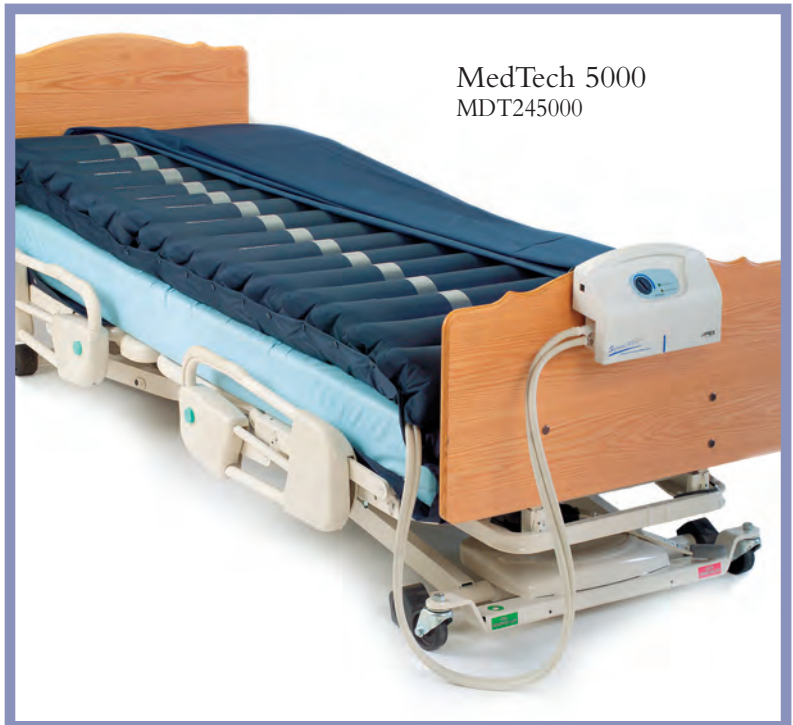
MedTech 5000 MDT245000