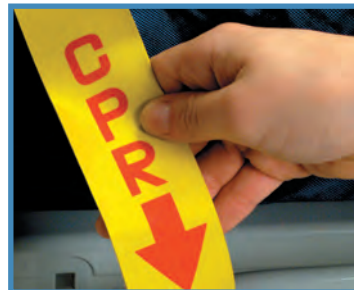
CPR pull for quick deflation