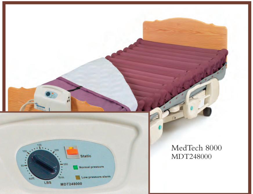
MedTech 8000 MDT248000