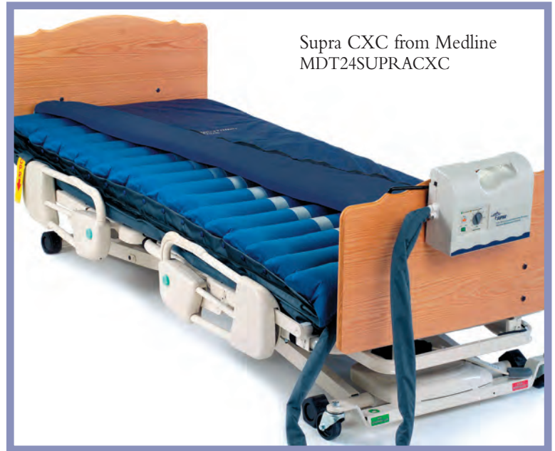
Supra CXC from Medline MDT24SUPRACXC

For More Information Call Toll-Free: 1-800-MEDLINE www.medline.com