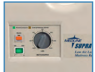
Air pressure easily adjusts from soft to firm based on patient weight