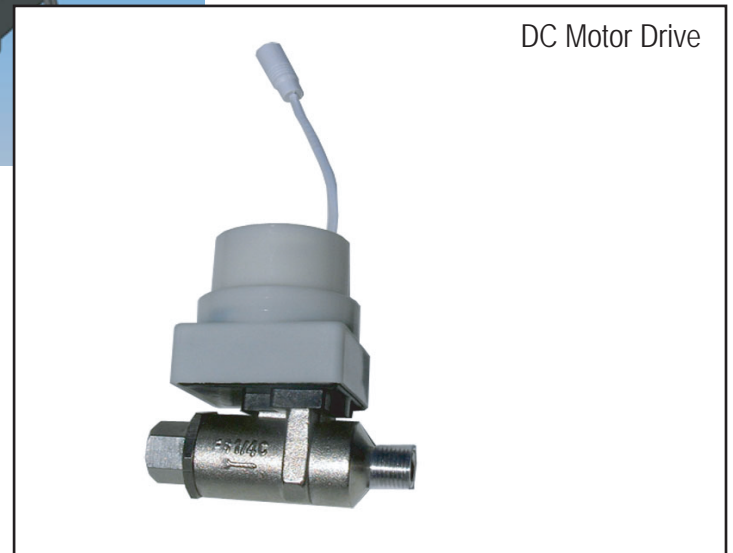
DC Motor Drive